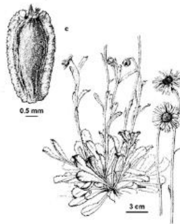
Line drawings (as Brachyscome spathulata subsp. spathulata ). e. plant; seed (front view). Gloria Thomlinson, Daisy Study Group, © 2021 Royal Botanic Gardens Board, Melbourne, Vic

Gloria is in care at a Frankston Facility.